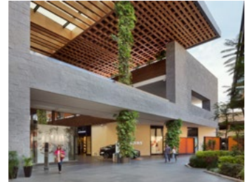
2010_LUXURY_HALL_PRINT_PHOTO_by_Paul_Rivera_01.jpg Image Description: Luxury Hall