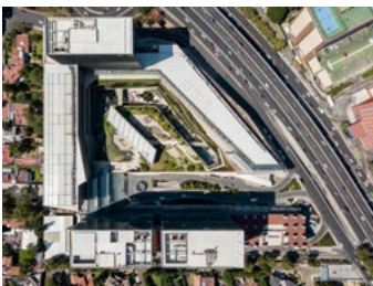
2018_ARTZ_SMA_PRINT_PHOTO_by_Rafael_Gamo_01.jpg Image Description: ARTZ Pedregal