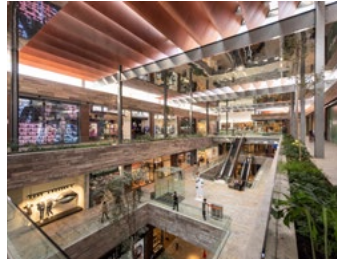
2018_AMPLIACIÓN_PLAZA_SATELITE_SMA_PRINT_PHOTO_by_Jaime_Navarro_05.jpg Image Description: Plaza Satélite