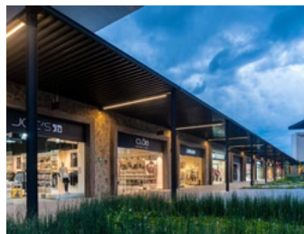
PREMIUM OUTLETS 5.09.19 (16).jpg Image Description: Premium Outlets Querétaro