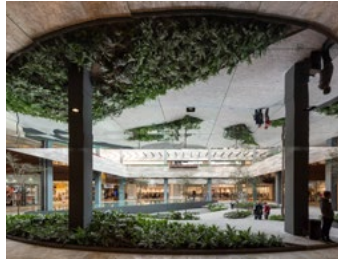
2018_AMPLIACIÓN_PLAZA_SATELITE_SMA_PRINT_PHOTO_by_Jaime_Navarro_01.jpg Image Description: Plaza Satélite