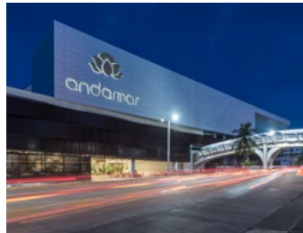
2014_ANDAMAR_SMA_PRINT_PHOTO_by_Jaime_Navarro_078.jpg Image Description: Andamar Lifestyle Center