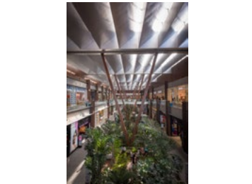
2014_ANDAMAR_SMA_PRINT_PHOTO_by_Jaime_Navarro_133.jpg Image Description: Andamar Lifestyle Center