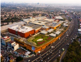
2020_PARQUE_PLAZA_SATELITE_PRINT_PHOTO_by_Jaime_Navarro_01.jpg Image Description: Plaza Satélite