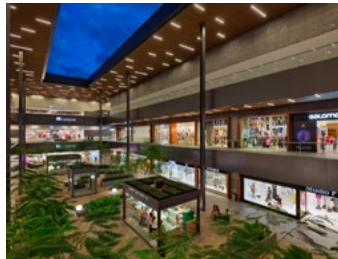
2013_ANTEA_PRINT_PHOTO_by_Paul_Rivera_05.jpg Image Description: Antea Lifestyle Center