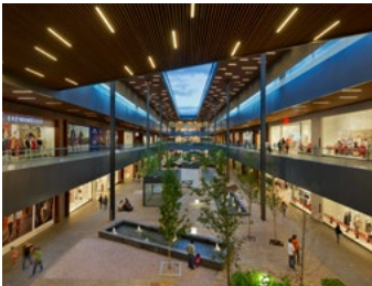
2013_ANTEA_PRINT_PHOTO_by_Paul_Rivera_04.jpg Image Description: Antea Lifestyle Center Image Credit: © SOMA, photo by Paul Rivera