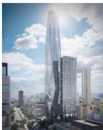
20200804_TRC_SMA_VC.jpg Image Description: Reforma Colón