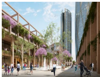
1 TRC CC BR.jpg Image Description: Reforma Colón